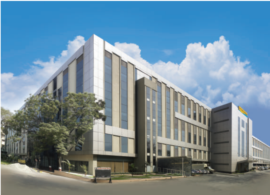
Switchgear Factory, Mumbai

L&T offers a complete range of low voltage switchgear products that includes Air Circuit Breakers, Moulded Case Circuit Breakers, Switch Disconnect Fuse Units, HRC Fuses, Contactors, Overload Relays, Motor Starters, Timers etc. This apart, L&T manufactures associated products viz., Control and automation equipment, metering and protection systems.