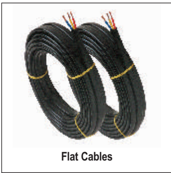
1.5 mm 2 to 70 mm 2