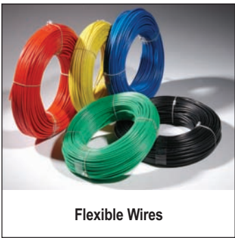
0.5 mm 2 to 1000 mm 2