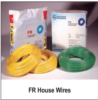
0.75 mm 2 to 25 mm 2