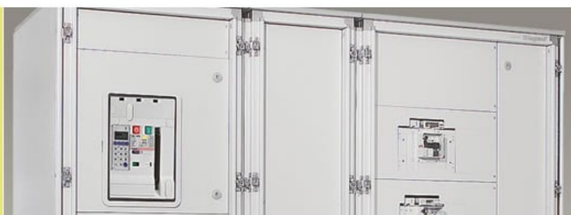
XL 3 Power Distribution Enclosures

➡ The new XL3 range offers enclosures upto 6300 A.