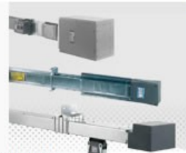
ZUCCHINI BUSBAR TRUNKING SYSTEM Medium Power Busbar

A busbar is the ideal solution for every type of connection and gives you different advantages compared to a traditional cable installation. Zucchini medium power busbars are available in sizes ranging from 63 A to 1000 A with air insulated aluminium and copper conductors. Medium power busbar: MS- 63 – 160A, MR – 160 – 1000A, TS- 63- 250A