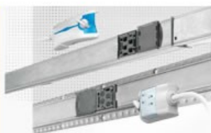
ZUCCHINI BUSBAR TRUNKING SYSTEM Low Power Busbar

➡ The new XL3 range offers enclosures upto 6300 A.