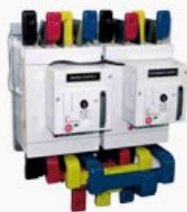
Automatic Transfer Switch

In applications where even the slightest delay in supply could result in low losses, the DPX3 range of MCCBs can be efficiently used as an Automatic Transfer Switch for power switching. When connected with the microprocessor control box (line changeover unit) it gives you the flexibility to manage that automatic changeover between two supply lines effectively with remote controls.