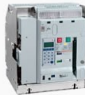
DMX 3 Air Circuit Breakers

These new ACBs offer efficient protection and control for all types of buildings. The range covers 11 rated currents, between 630A to 6300A