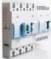
DPX 3 & DPX MCCBs

The new range of Moulded Case Circuit Breakers from 16A to 1600A provides improved protection and control for all your low voltage installations.