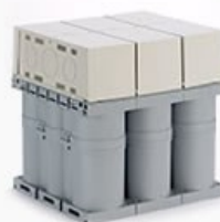
Alpivar 2 & Alpican™ Capacitor

Legrand's range of solutions for reactive energy compensation, giving you the power to contribute to energy savings and reduce environmental impact.